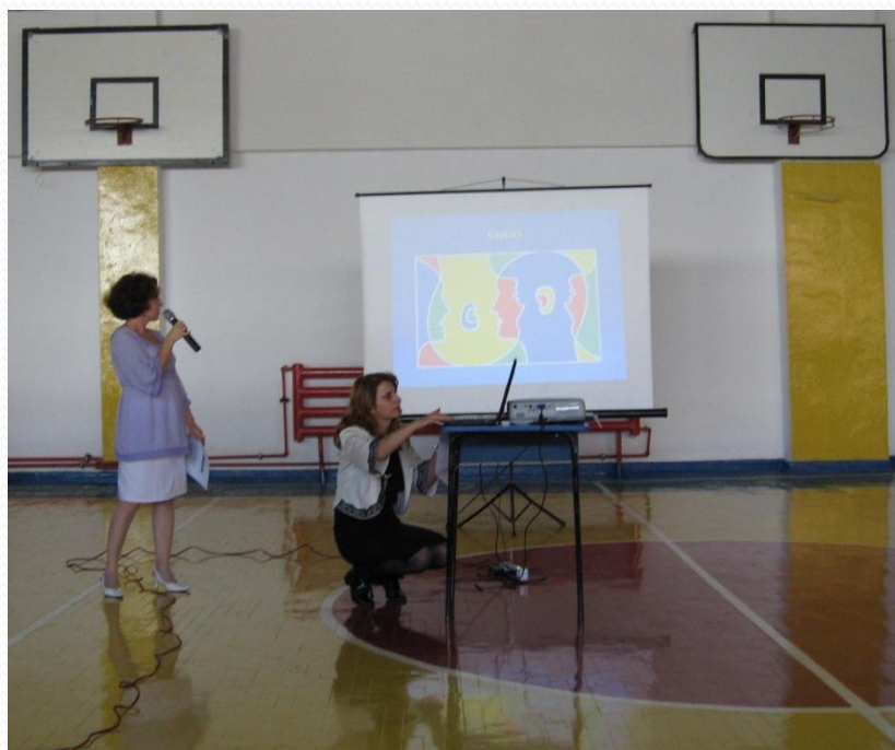
Meetings with the students